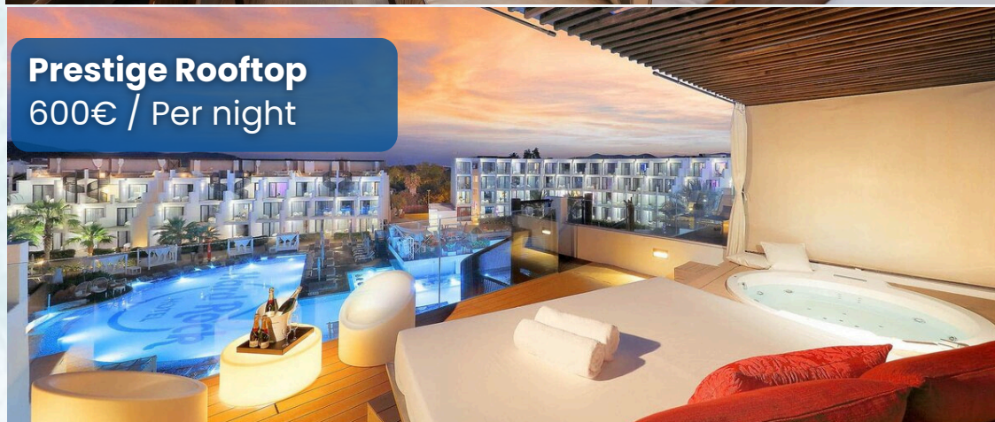
Prestige Rooftop 600€ / Per night