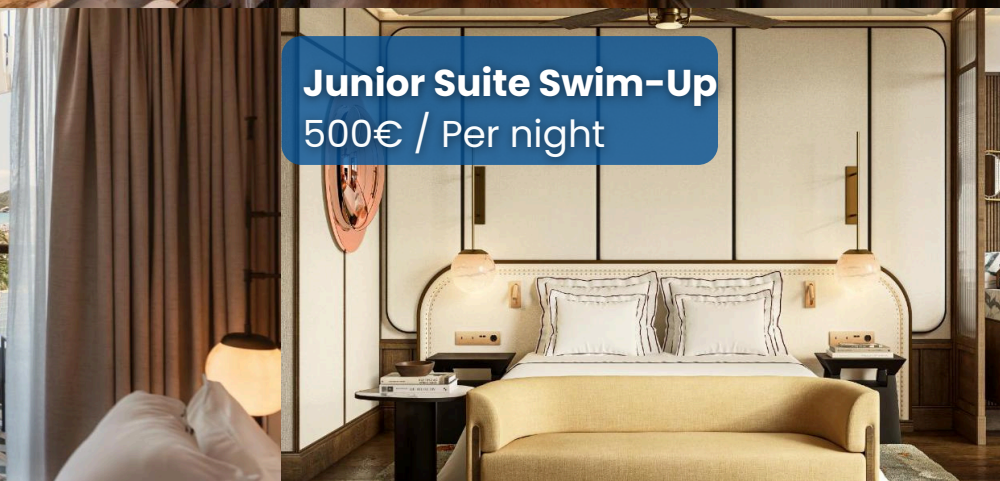
Junior Suite Swim-Up 500€ / Per night