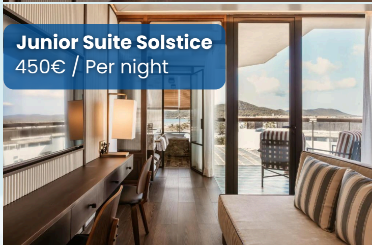
Junior Suite Solstice 450€ / Per night