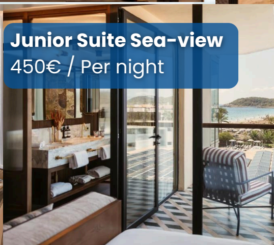
Junior Suite Sea-view 450€ / Per night