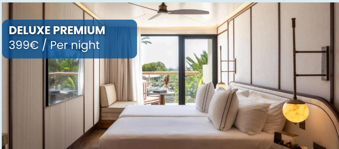
DELUXE PREMIUM 399€ / Per night